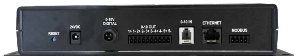
Back side view of the Echo Air with all available connections